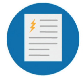
Subscribers receive a credit on their utility bill with no change in service