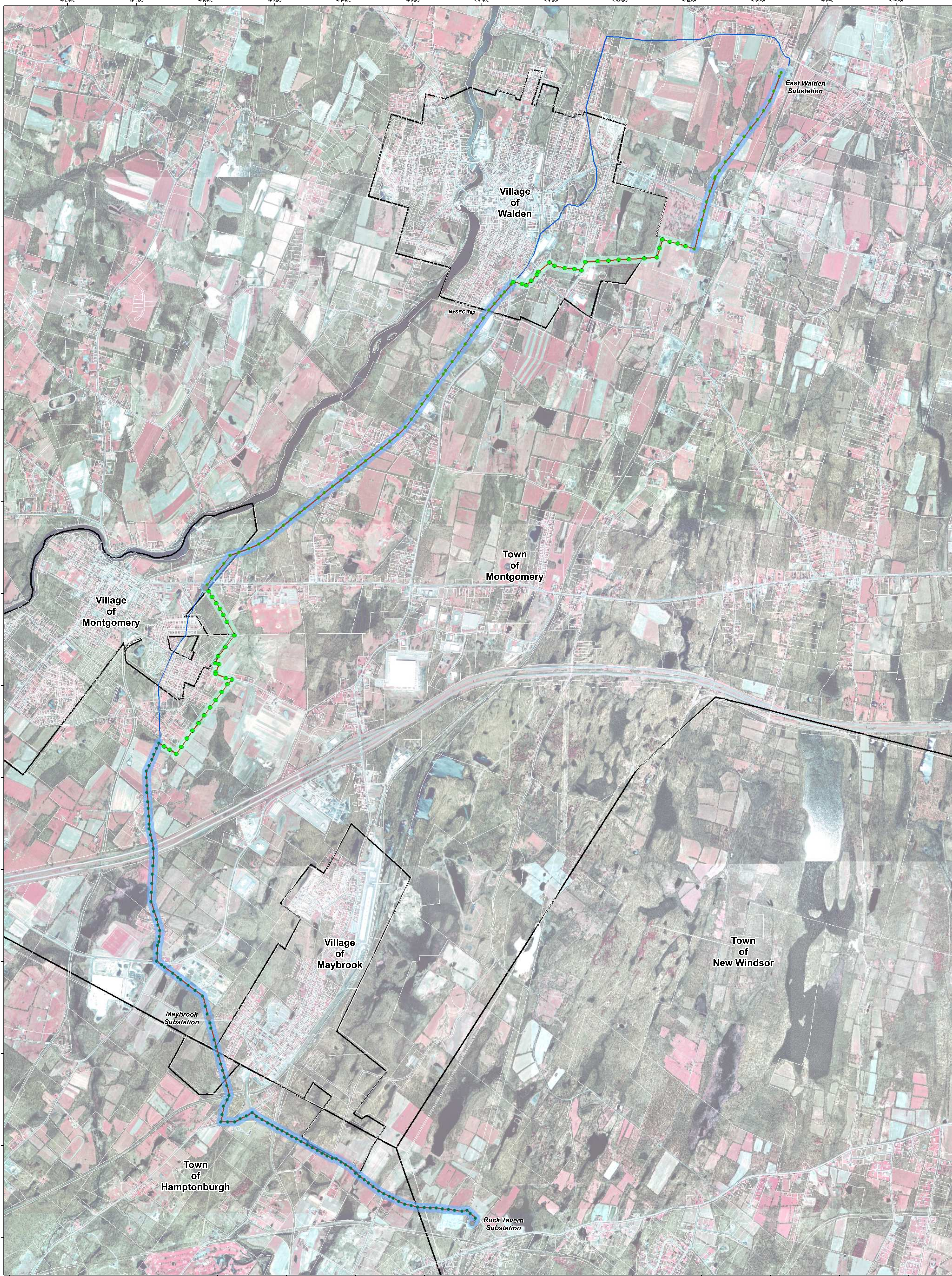
Central Hudson Gas & Electric WM Transmission Line Rebuild Project Figure 4b. Proposed Route